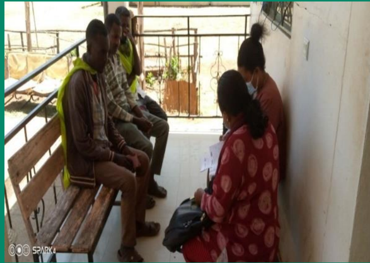
pic.2 Health extension workers providing ART refilling at Debre Markos prison