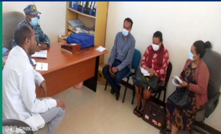
Pic.1 TSDA team and health extension worker discussing the CAG model implementation with prison administration and clinical provider in the prison clinic